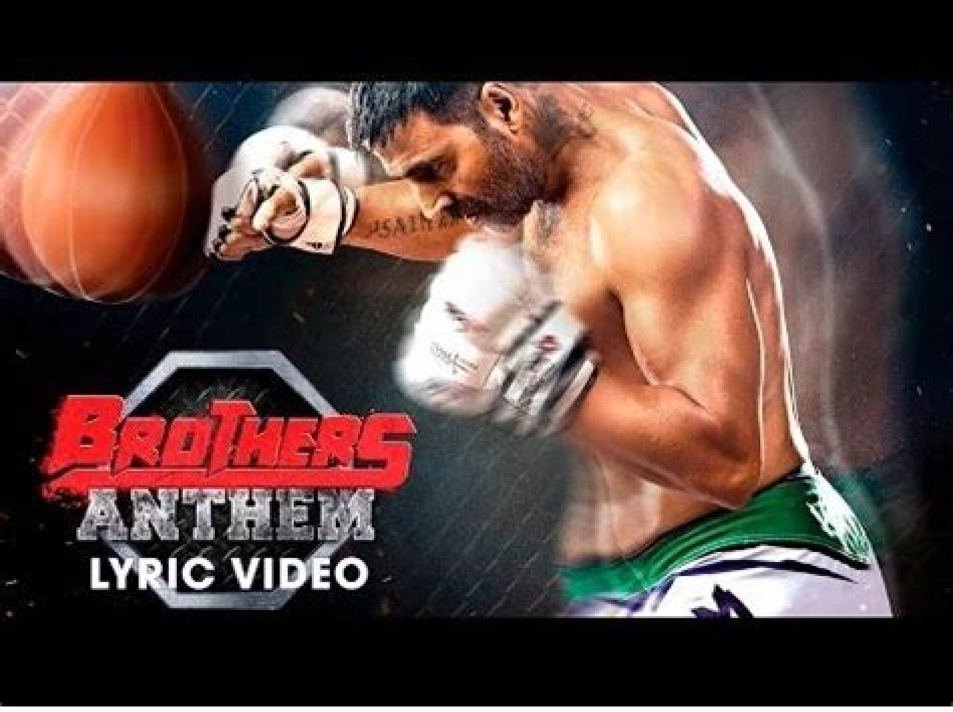
Brothers anthem song status download.